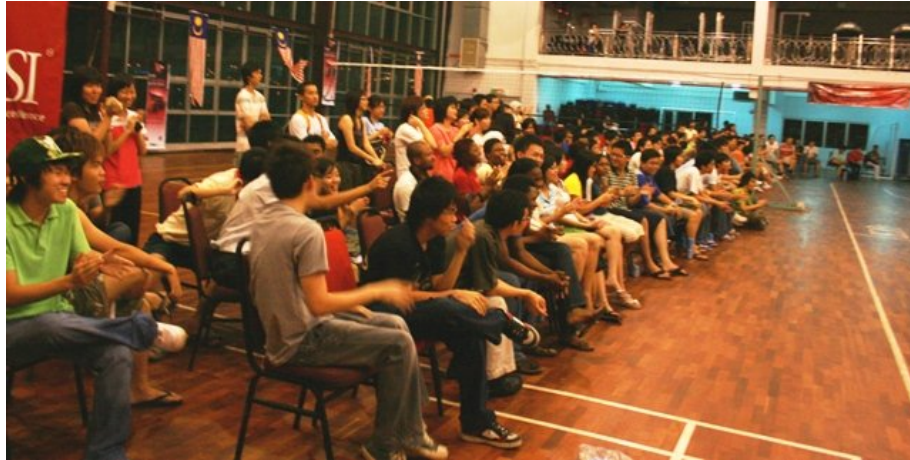
Students cheering at the basketball finals at the MPH

It was a game not to be missed, and everyone had been talking about it as they were all looking forward to watching it later that night. Girls were hoping to catch glimpses of beautifully-toned players, while the guys were anticipating who would slam dunk and which team would emerge as champion. Yep! You guessed it right. It was the finals of the basketball men's division at the UCSI Merdeka Sports Open 2007.