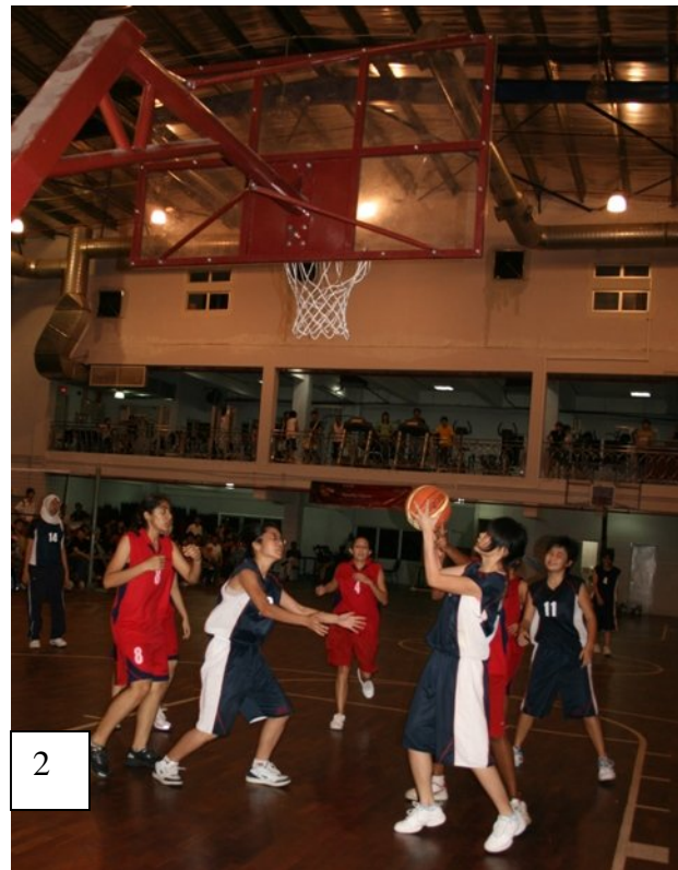
1. UCESI men's basketball team player going for a slam dunk 2. UCESI women's basketball team versus HELP University College