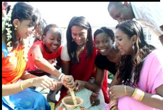
Some international students taking part in making the sweet glutinous rice.