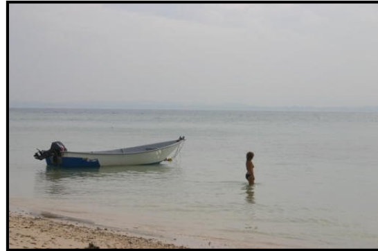
Taking a dip in the beautiful sea at Pulau Kapas

From Kuala Terengganu, it is about another 20 minutes’ drive to the Marang Jetty, where a boat transfer to Pulau Kapas takes 15 minutes.