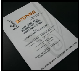
A close-up of the Bronze Award